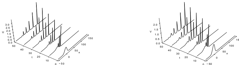
Figure 2. Numerical solutions for \Delta t = 0.01 and 2M = 1024 .